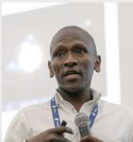
Vice-President: Lerothodi Leeuw (South Africa)