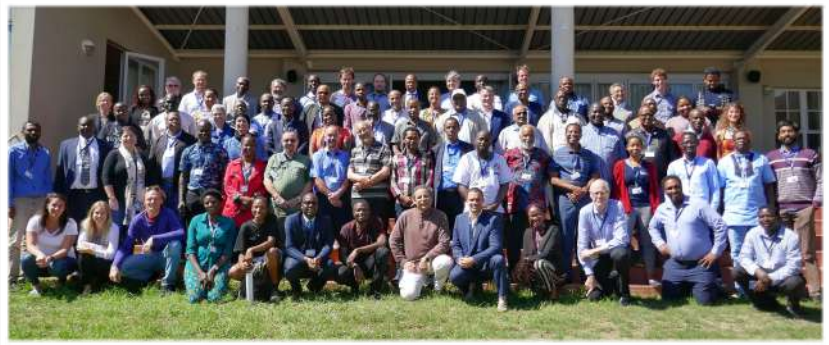
Participants of the Astronomy in Africa meeting in Cape Town, Mar 25-26, 2019

based on massive international projects on the continent such as the Square Kilometre Array (SKA), the VLBI network and the Southern African Large Telescope. Several African countries are already involved in these projects and the scientists are leading globally in the research. These complement capacity building initiatives to train young Africans, including DARA's Newton Fund program in astronomy, engineering and related fields. Scientific potential of other African facilities in countries like Ethiopia, Burkina Faso, Ghana, Mozambique, Morocco, Egypt, Algeria, to name of few, were also discussed during the meeting.